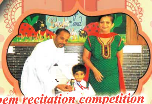
1st & 2nd Position in Fancy dress and 1st position in poem recitation competition at Inter School 'Little Idol' Competition for KG Students at Millennium School